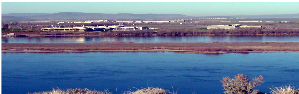
WSU Tri-Cities Campus in Richland, WA